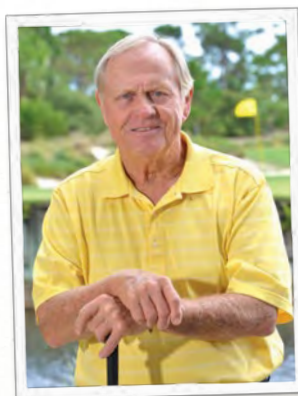
Jack Nicklaus The First Tee Trustee World Golf Hall of Fame Member

Please join The First Tee Legacy Society and make a positive impact on our young people, who represent 100% of our future.