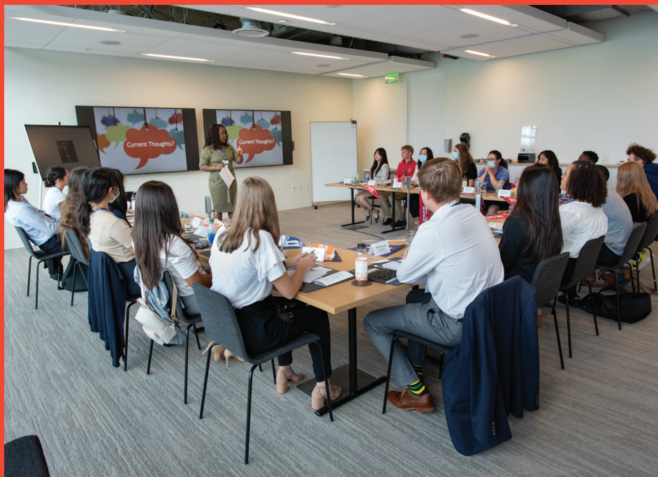
Workshop at PGA TOUR Global Home

In its second year, our need and merit-based scholarship program supports 12 scholars, bringing the total to 21. This program provides financial funding, adult mentorship, professional development workshops and internship placement.