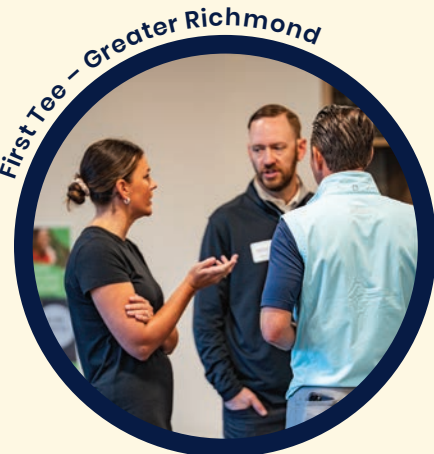
First Tee – Greater Richmond