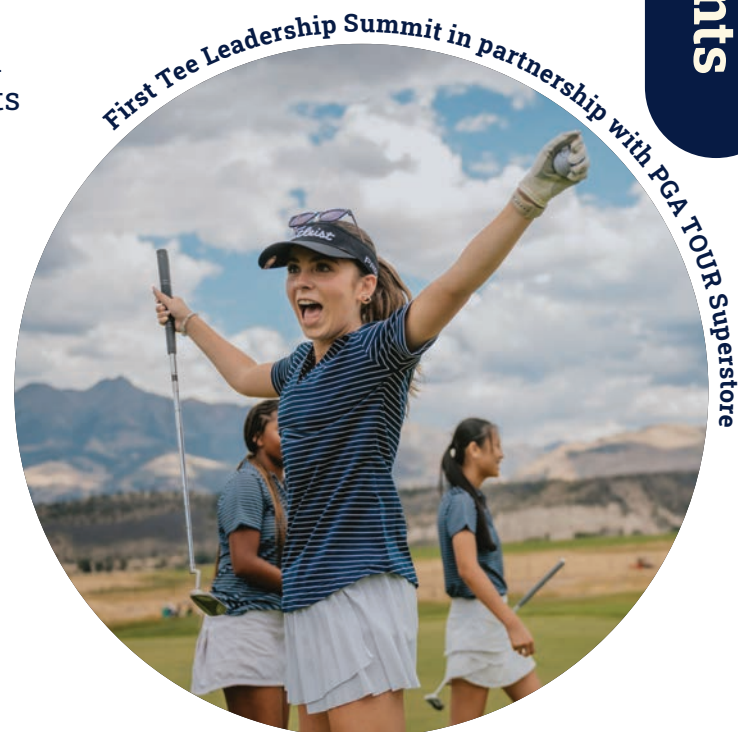
First Tee Leadership Summit in partnership with PGA TOUR Superstore