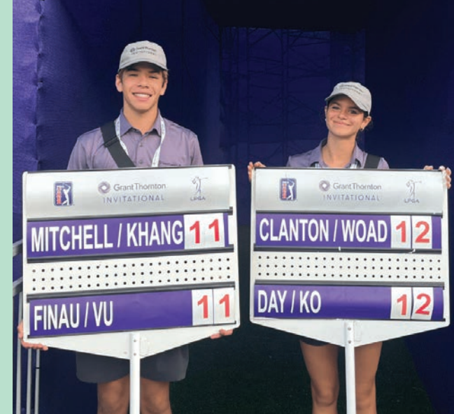
First Tee – Naples/Collier

First Tee – Greater Washington, DC hosts a Teen Summit and a Teen Advisory Council.