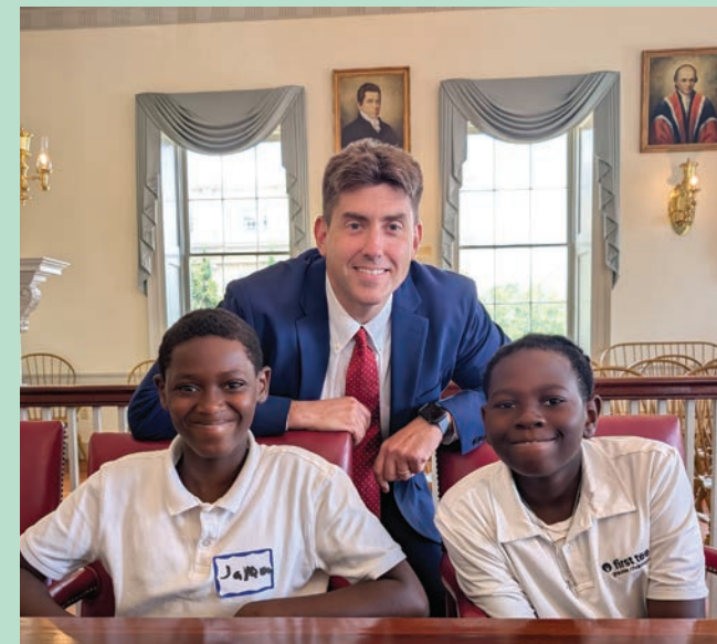
First Tee – Greater Charleston