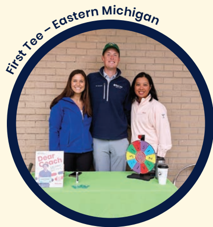
First Tee – Eastern Michigan