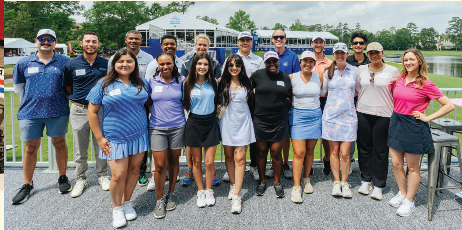
First Tee alumni attended the Chevron Championship in Houston.

We engaged hundreds of alumni at social meetups, professional development sessions and partner opportunities in 2025.