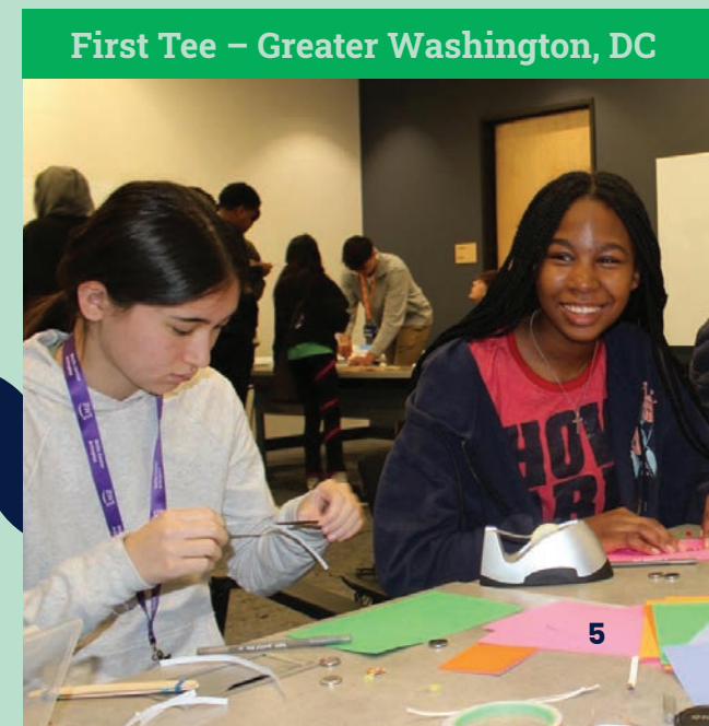
First Tee – Greater Washington, DC